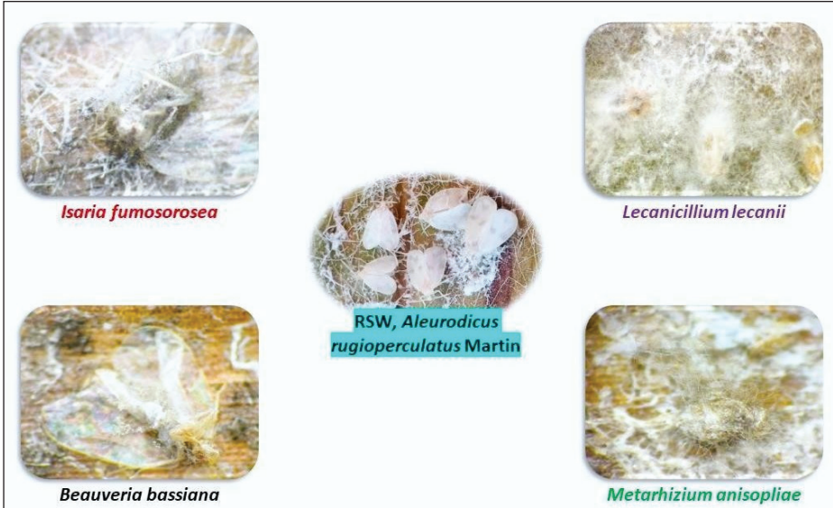
Figure 2. Fungal pathogens of Rugose spiraling whitefly (RSW)