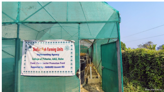
Figure 1: Biofloc Fish Farming Units at College of Fisheries, AAU, Raha

species. Phytoplankton, bacteria and aggregates of both living and decaying organic matter, along with organisms that graze on bacteria, accumulate in the system where a dense microbial floc develops (Zafar and Rana, 2022).