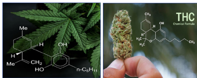
Figure 1: Chemical structure of CBD ( https://www.fda.gov/ )

C annabis ( Cannabis sativa ) (Common names: Weed, Bhang, Ganja, and Hashish) is a native plant of Cannabaceae and contains more than eighty chemical compounds that are biologically active. Delta-9-tetrahydrocannabinol (THC) and cannabidiol (CBD) are the most widely recognised compounds. THC is the component that generates the high associated with the use of marijuana (Figure 1). There has been widespread concern about CBD and its potential for beneficial effects. There is a difference between marijuana and CBD. In the cannabis plant, CBD is a pure substance and marijuana is a type of cannabis plant or plant product that absorbs several compounds, including CBD and THC. Just only one CBD medication, a prescribed drug to treat two rare and severe types of epilepsy, has been approved by the FDA (Food and Drug Administration). Currently, marketing and selling CBD products by adding it as a nutritional supplement to food is unconstitutional. The FDA has only seen limited CBD safety information and these personal anecdotes to risk factors that need to be considered for any purpose before taking CBD. Some CBD products are marketed and are of unknown quality with untested health services. The FDA will keep updating the public.