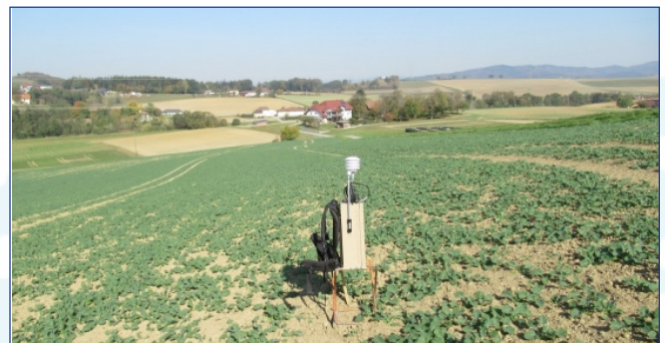
Figure 2: Soil moisture heterogeneity mapping in Petzenkirchen (research station of Austrian Institute for Land and Water Management Research) using backpack CRNS.

The Joint FAO/ IAEA Division of Nuclear Techniques in Food and Agriculture is launching a new Coordinated Research Project (CRP) titled 'Enhancing agricultural resilience and water security using Cosmic-Ray Neutron Sensor' to use the CRNS and the GRS to measure, assess and monitor soil moisture for the purpose of agricultural water management: irrigation scheduling, management of extreme weather events (flood and drought), and development of climate change resilience strategies. The overall objective of CRP is 'Establishing landscape soil moisture sensing using CRNS for improving agricultural water management practices and climate resilience strategies'.