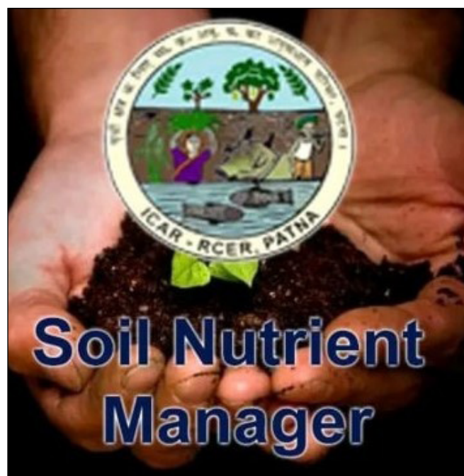
Figure 1: The logo of Soil Nutrient Manager App

Fertilizer is one of the most costly inputs in crop production. Its indiscriminate application not only affects crop productivity and farm income, but also causes harm to soil and environment. An Android based mobile application named 'Soil Nutrient Manager' was therefore developed to optimize fertilizer application and to achieve higher crop yield and farm income in eastern India, particularly Bihar and Jharkhand. The app makes fertilizer recommendations based on native soil fertility status and nutritional requirements of the crop to be grown in a particular region. It can be downloaded from Google play store for free. While searching in Google play store, one can identify the app by seeing its logo as shown in Figure 1. Sequence of the screen appearances that a user finds during registration is shown in Figure 2. Registration process is very simple and requires only user's name, mobile number and an eight-digit password.