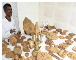
a) Different articles from cow dung