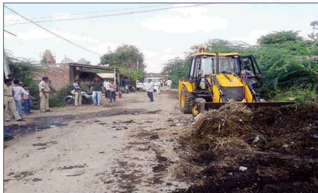
Figure 1: Dirtiness caused by the dung and the waste of dung