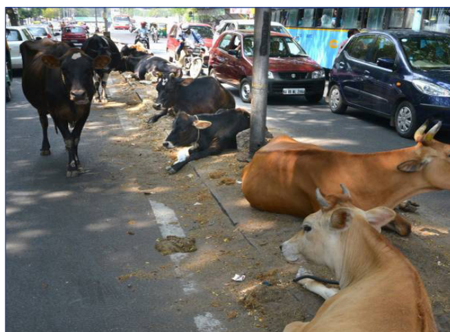
Figure 2: Wastage of dung in rural/ urban areas