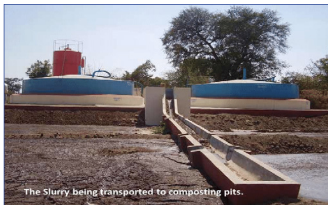
Figure 3: Community biogas Plant at Bhintbudrak Dist. Surat, Gujarat