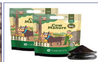
f) Cow dung manure