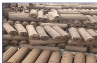
e) Cow dung cake