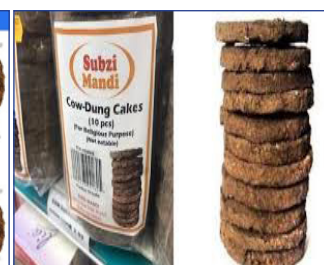
d) Cow dung cake