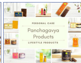
b) Personal care products from cow dung