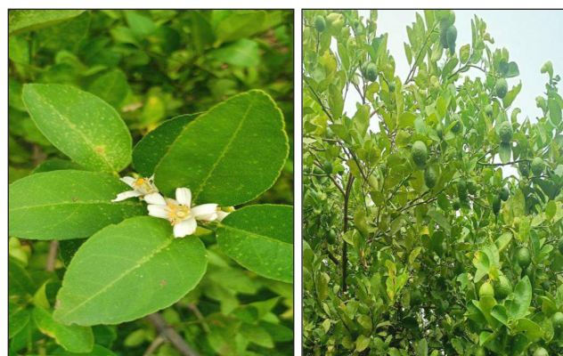
Figure 1: Flowering and fruiting stage of acid lime tree

methods of delivering nutrients directly to the metabolic site and nutrients are not lost as occurs with soil application. Among various PGR's, gibberellic acid proved to be the most effective growth regulator to prolong the blooming duration and enhance both the yield and quality of fruits during the hasta bahar season.