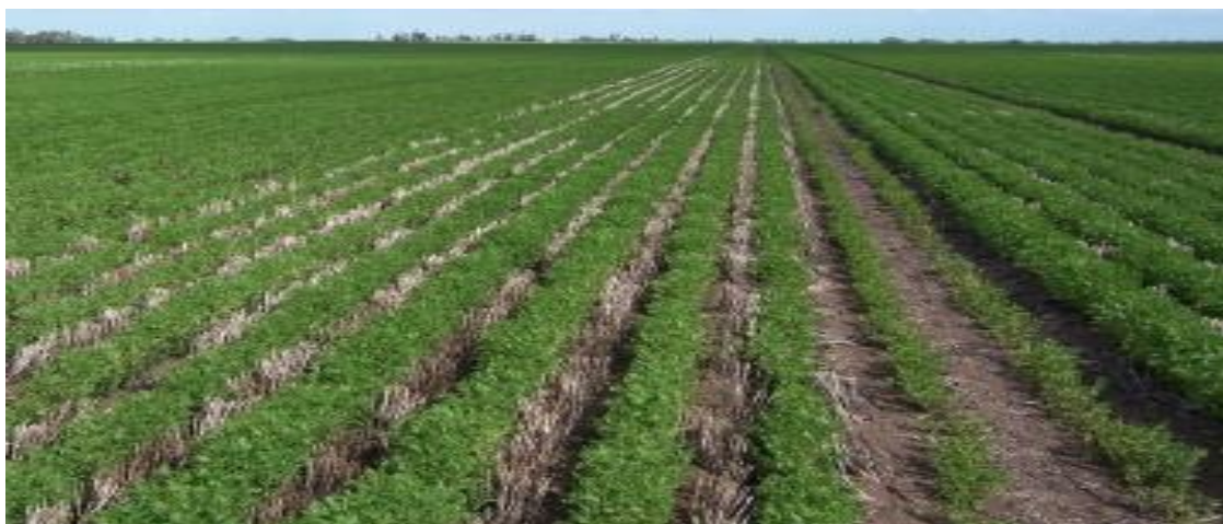
Fig. 3. Sowing of lentils between rows of cereal stubble helps to prevent lodging and improves harvest efficiency

Pulses fit very well into farming systems and crop rotations because of their disease control, weed control, soil fertility timeliness and financial benefits. They are a cash crop with important additional rotational and whole farm system benefits including fitting into grazing systems. Pulse fit well into modern farming system, particularly where minimal or no tillage farming is practised and where a cereal stubble retention system is in place. Erosion risks are minimal in pulse grown with no tillage and standing stubble situation. When pulse grown in rotation with cereals, they have advantage of providing an alternative income.