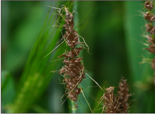
Figure 1: Characteristics symptoms of loose smut on spikelet's

they should be considered as distinct species. The disease is internally seed borne. The mycelium of the fungus lies dormant in the grain.